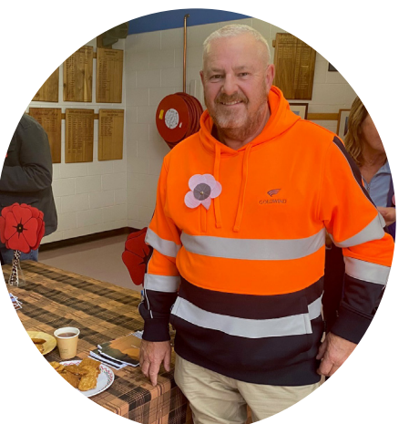
'It's great to see the community come together.'